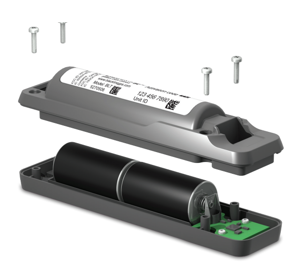
Easy Location Beacon Battery Replacement